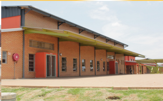
DEPT. EXCELS IN BUILDING INFRASTRUCTURE PROJECTS PG-09