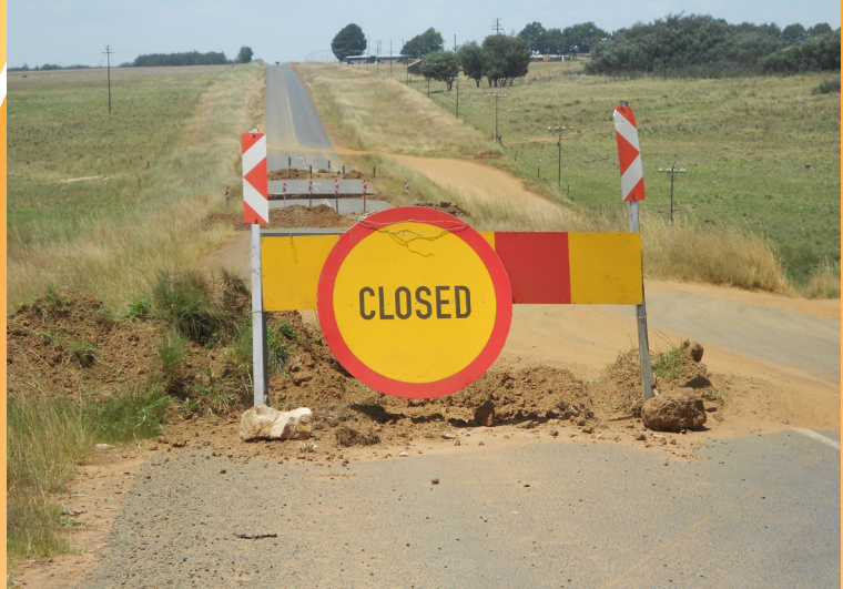
Signs warning motorist about the closed road.

An exercise is planned to locate and identify similar culverts on all Provincial paved roads and inspect each one for possible defects or risks. The key issue is the protection of the inlet by a suitable concrete headwall to channel water into the culvert without risk of erosion around it. The structure itself must also be checked for corrosion and signs of deformation concluded Pienaar.