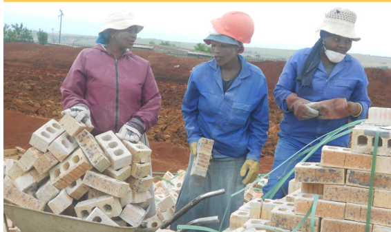
CRDP BRINGS CHANGE IN THE LIVES OF... PG-05