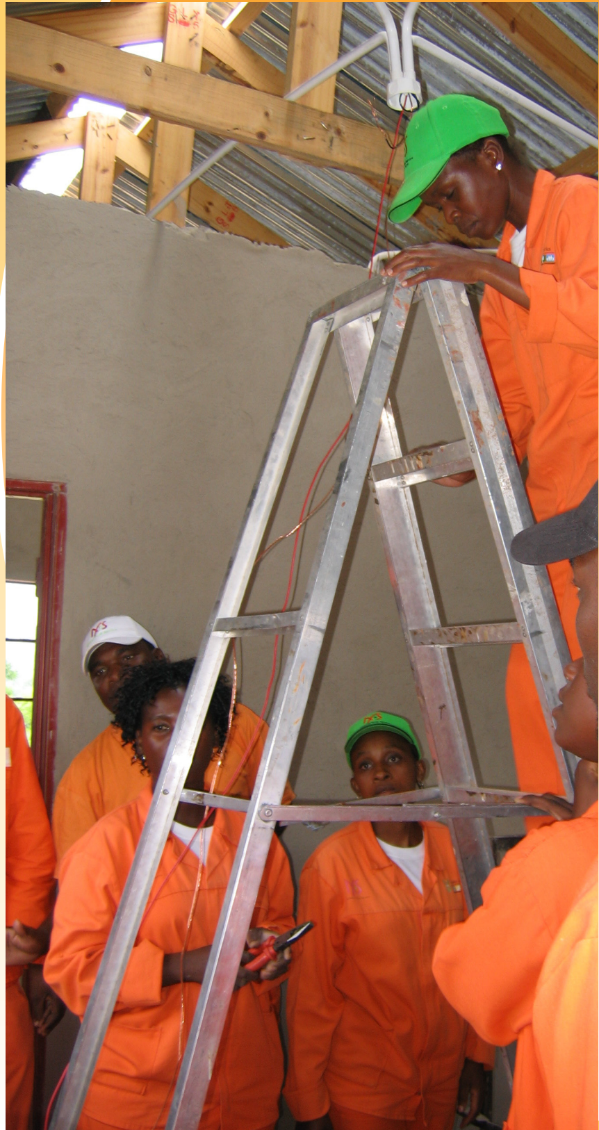
Women who take part in some of the EPWP projects.