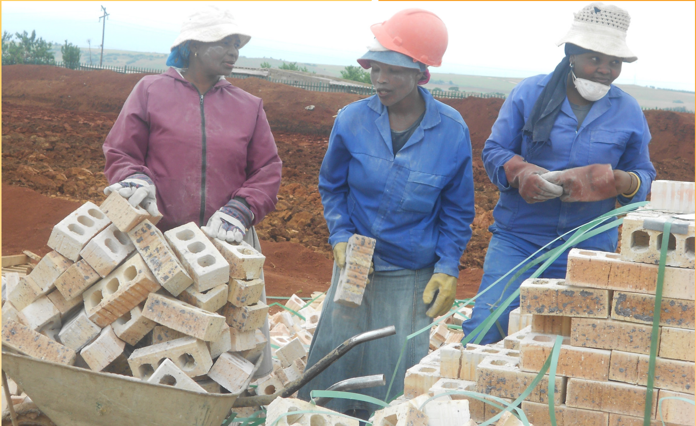
Hard at work are some of the women who benefitted from construction projects.