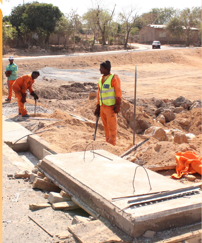
Construction projects in Mpumalanga which are planned according to the MIMP.