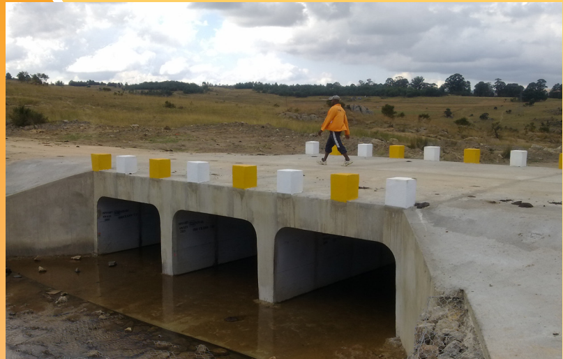
Mambazane Culvert Bridge

Bus shelters are also part of IRMA projects, The Dr JS Moroka Local Municipality in the Nkangala District has benefited from this projects, the community around the municipality uses buses as a mode of transport.