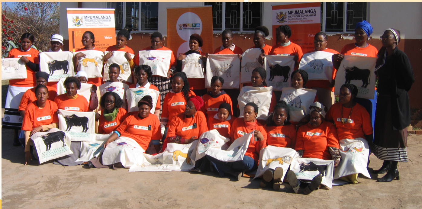
Participants in the EPWP projects showcasing their work.