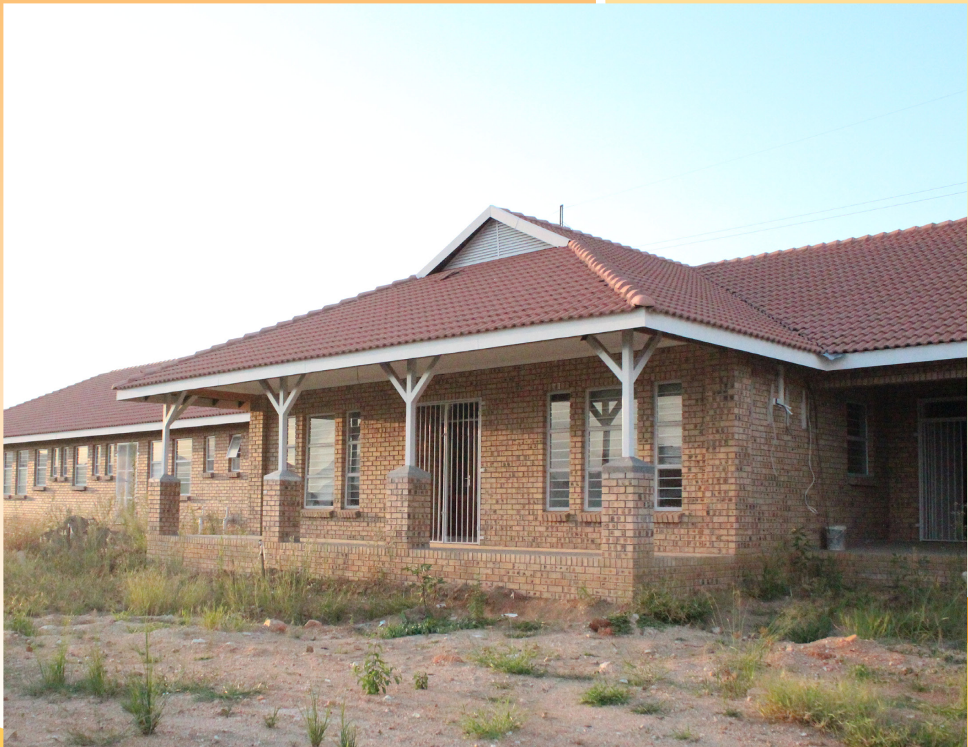
One of many clinics in the province which have been constructed by the Department.

"There is still more to be done by Department in terms of infrastructure projects. Plans for the next financial year includes the phase two construction of the Traffic College, many clinics, upgrading and renovation of Mpumalanga Nursing College. People of Marite in Bohlabela will also benefit from the construction of the Department of Social Development offices in the next financial year. So many work will be done to improve the lives of people of Mpumalanga by the Department of Public Works, Roads and Transport", she concluded.