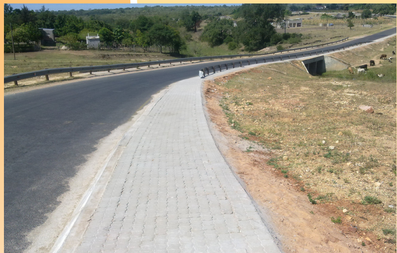
Sidewalk in Boschfontein