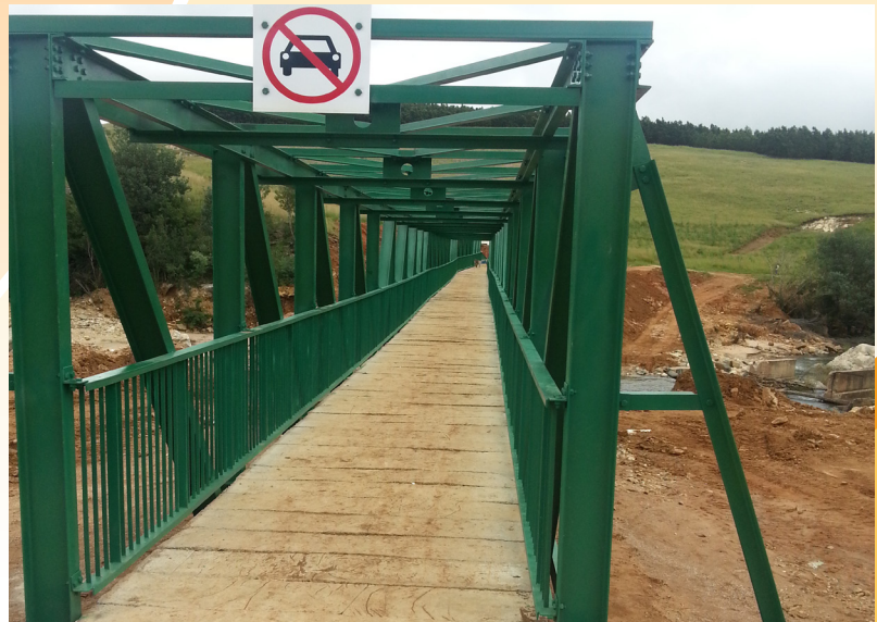
Foot Bridge in Ntombe two.