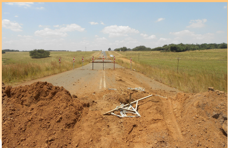
work has already started on the bridge.