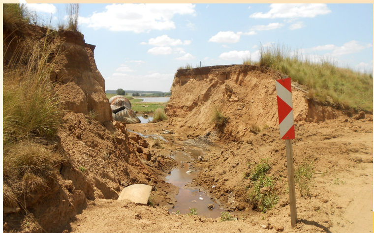
The 10 meter height of the collapsed bridge.