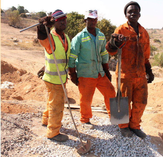
Men taking part in construction which is part of the Mpumalanga Infrastructure Master Plan (MIMP)

In November 2012 the Department presented a final draft to Exco where the Department was instructed to conduct thorough consultations with all relevant sectors. The various sectors that need to be consulted included amongst others SAPPI, TSB, Mining housing, freight transport, Local and District municipalities. The discussions were based on getting their views and inputs on the MIMP in order to agree on what should be covered. The consultations were also used as awareness campaigns to inform the various sectors of what government intends to do. The consultations have since been finalised and final approval is awaited from EXCO before implementations phase.