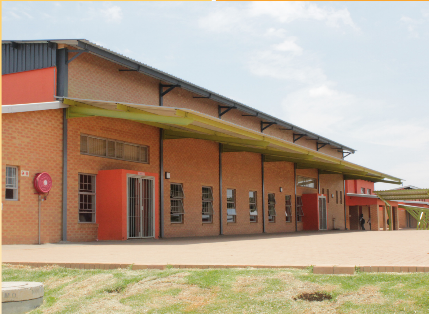
Vezimfundo Primary School in Delmas is one of the infrastructure projects of the Department.

T he Department has been hard at work in ensuring that the lives of people of Mpumalanga are changed for the better. As the 2012/13 financial year is about to end, looked at the progress on infrastructure projects in the Department.