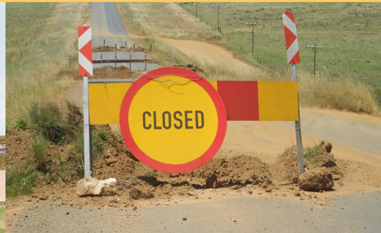
WASHED AWAY BRIDGE TO BE RECONSTRUCTED... PG-11