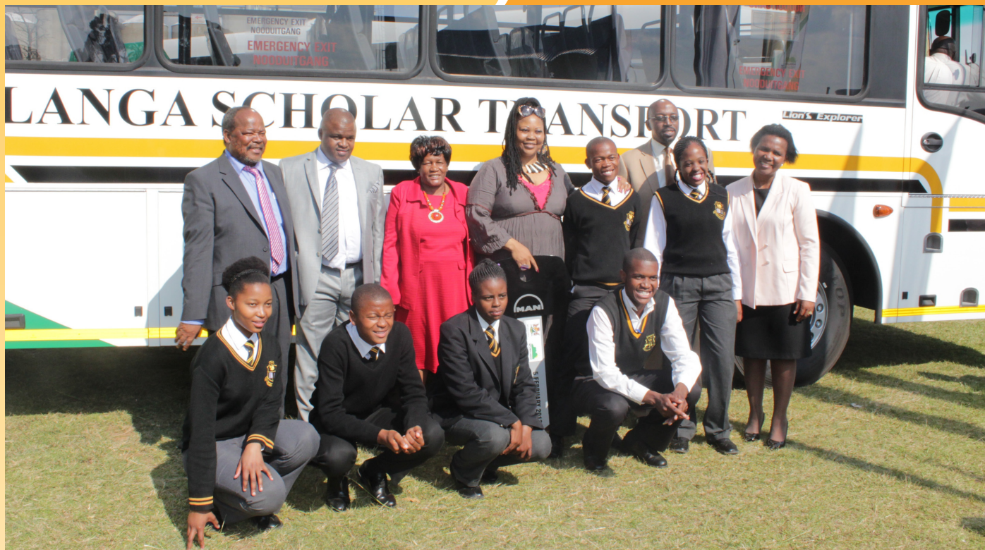
MEC Dikeledi Mahlangu ( with spectacles) with officials from the Department, Gert Sibande District Municipality dignitaries and learners from various schools in Gert Sibande.

The MEC for Public Works, Roads and Transport in Mpumalanga, Dikeledi Mahlangu, officially launched the scholar transport buses on the 6 th of February 2013 at AJ Swannepoel stadium in Ermelo at the Msukaligwa Local Municipality. The MEC was accompanied by the Executive Mayor of Gert Sibande District Municipality Cllr Mishack Nhlabathi, Executive Mayor of Msukaligwa Local Municipality Cllr Sipho Bongwe and the Department of Education District Head in Gert Sibande Ms Nokuthula Mthethwa. More than 1500 learners and parents from the schools which benefited from the also attended to witness the official launch of the pilot project which aims to ferry learners who travel more than five kilometres to school on foot.