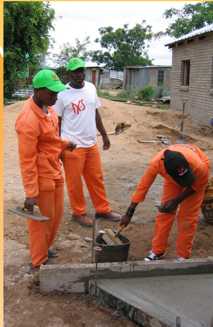
Construction projects under EPWP.

To date, the overall achievement of the province in terms of job creation for the year 2012/2013 financial year stands at 49 014, with the Environmental and Culture Sector and Non state sector exceeding the set target. The EPWP has reported a total of 12 378 job opportunities with a target of only 8706 whereas the latter has 4003. The other sectors namely the Infrastructure Sector is falling behind with at least 37 945 target with only 14 487 job opportunity created. The Social sector has reported only 4 977 instead of the set target of 12 980.